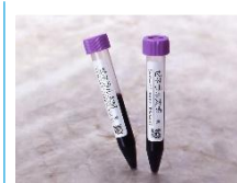
Medical use labels