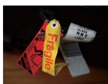
Retail tag labels